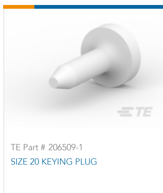
TE Part # 206509-1 SIZE 20 KEYING PLUG