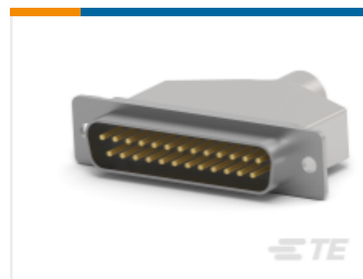
TE Part # CAT-AM7-248H4 IDC D-Sub: Connector Kit, Plug, Wire to Wire, Signal, 2.77 mm